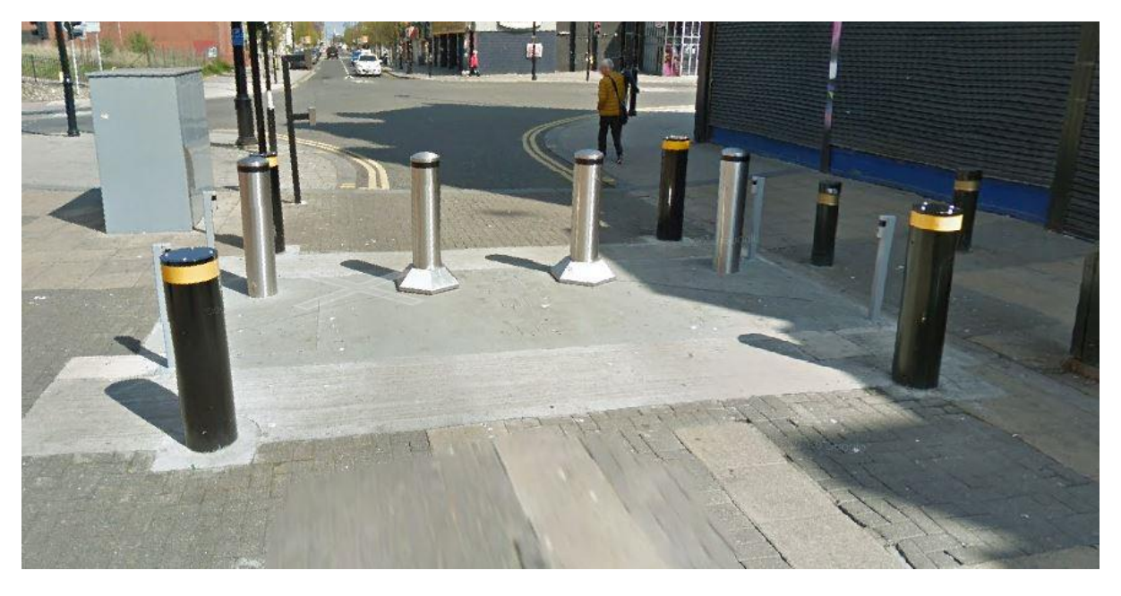
This sliding bollard system in South Shields includes additional black bollards which are not proposed for York.

Illustration of proposed hostile vehicle mitigation measures.